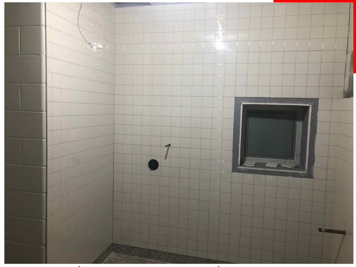
Family Living Center Bathroom Ceramic Tile Progress