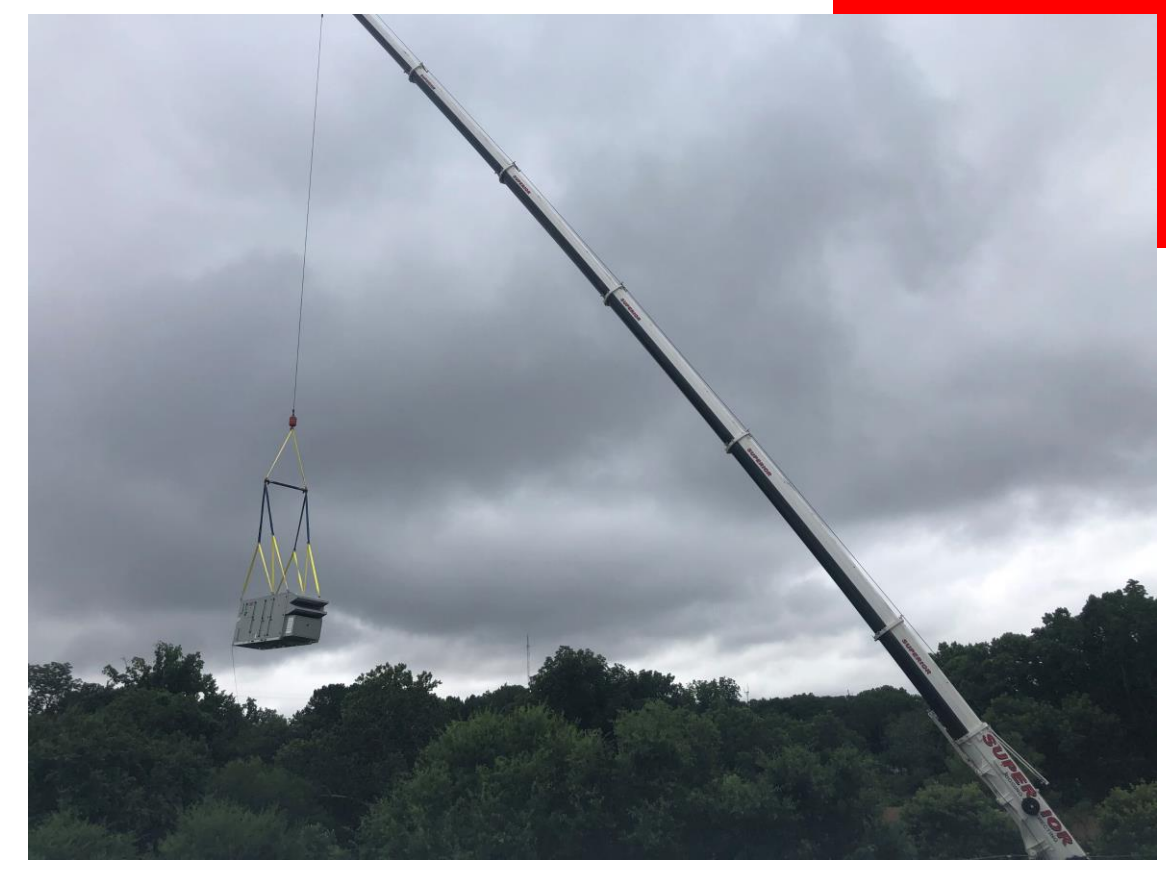
Set HVAC Units on the 8<sup>th</sup> Street Building, Theater Building, and Practice Gym