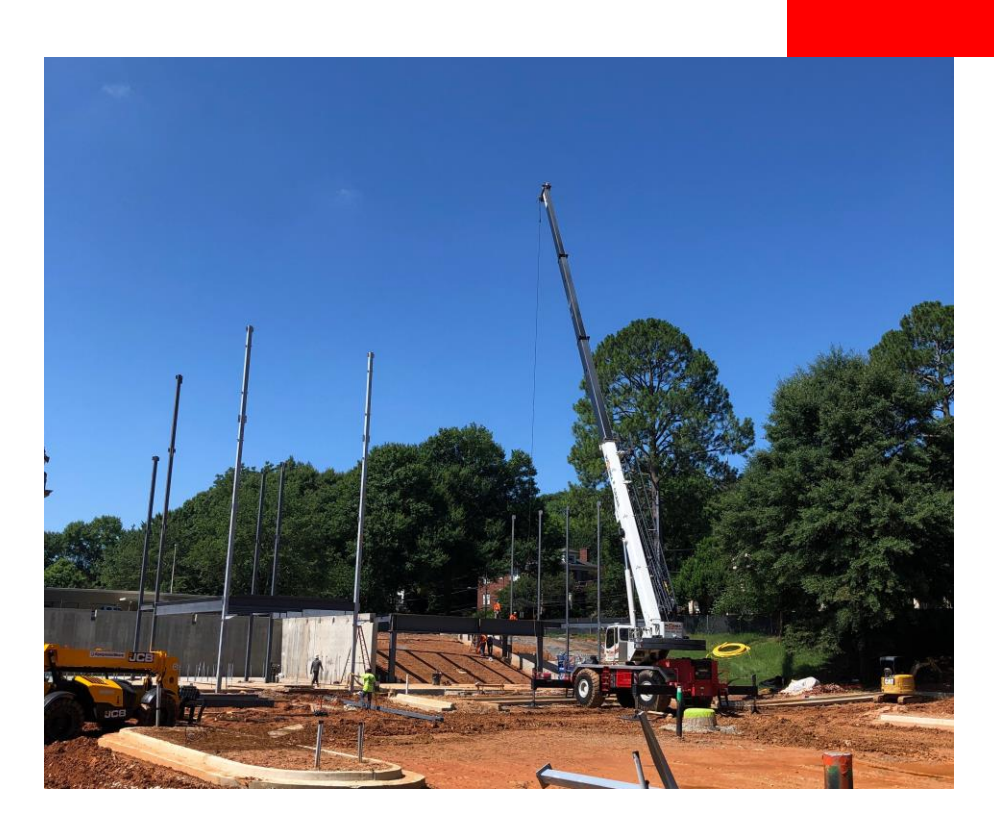
Steel Erection at New Addition