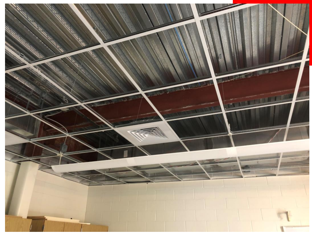
Lights and Ceiling Diffusers Progress in 8<sup>th</sup> Street Building